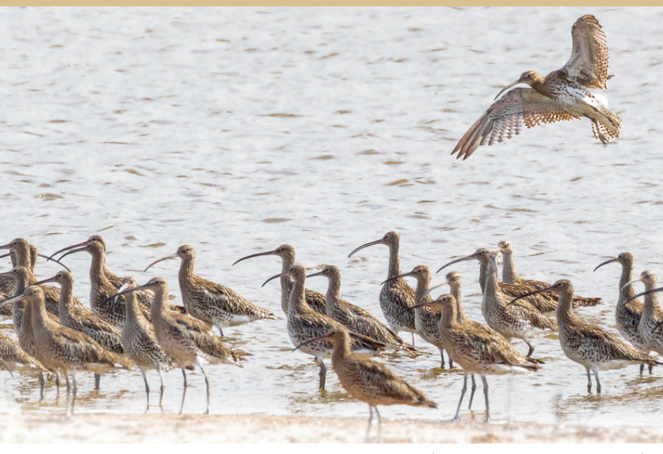
Curlew flock.