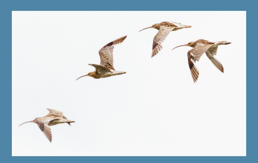
Curlews in flight.

After our summer break, we are returning to our regular free webinar series this autumn.