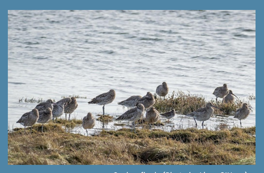
Curlew flock.

On Wednesday 13th September, we will be discussing Curlews on the move. The UK is of international importance to Eurasian Curlew, it is home to 25% of the global breeding population and during the winter months are shorelines play host to thousands of Curlew and other shorebirds who have migrated here to escape the colder winters elsewhere. How do they know where to go? How do we know where they are going? Do headstarted Curlew behave in the same way? Get your free ticket.