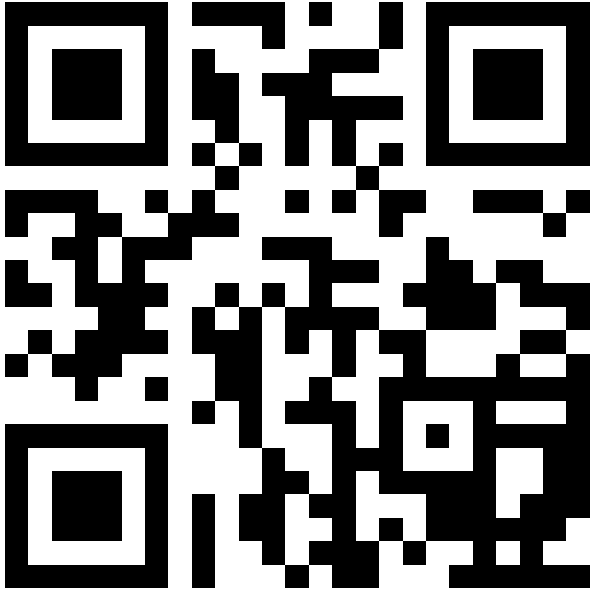
Curlew Action website QR Code